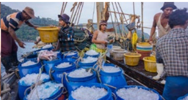
We had the idea that we'd head over in the tender and barter for some fresh fish! This was so much fun and one of the highlight of the trip for me.

Both events are free so there's no excuse for not taking advantage of the knowledge of these three men. Go to the website and sign-up now!