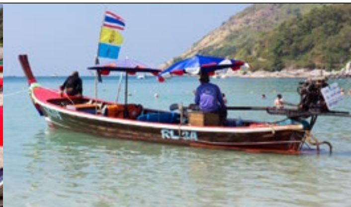
Nai Harn Bay and the Longboats that are a common form of water taxi and fishing boat around Thailand.