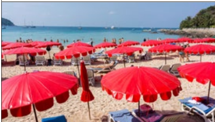
A view of Nai Harn Bay from the beach. We spent two nights here in this bay before provisioning for the trip to the offshore islands.