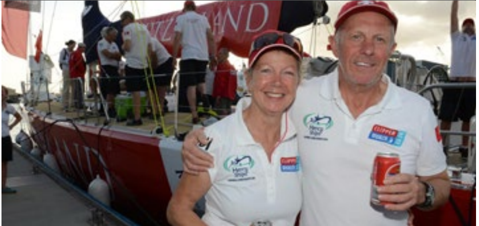
Switzerland claims its first win of the Clipper Race during Race 7 to Brisbane, Australia

Save-the-date for Sir Robin Knox-Johnson on Saturday, April 12th. One of nine sailors to compete in the Times Golden Globe Race , Sir Robin set off from Falmouth on June 14, 1968. He had no sponsorship for his attempt to conquer the Everest of the sailing world. With his yacht Suhaili packed to the gunwales with supplies – including bottles of whisky and fruitcake baked by his aunt – he set off on a voyage that was to last just over ten months. He arrived back in Falmouth after 312 days at sea, on April 22, 1969, securing his place in the history books as the first man ever to sail solo and non-stop around the world. In 2007 he