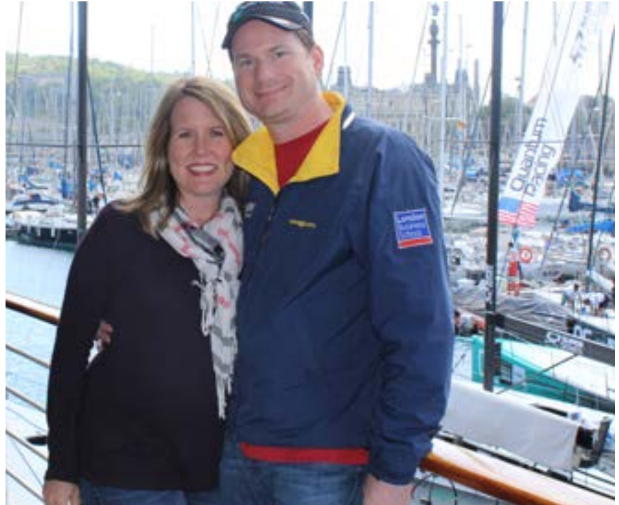
"We can not speak highly enough about the professionalism and generosity of Quantum's program... The TP52s sailed aggressively and beautifully."

So grab your Honey, get a date or invite your friend, and sign up quick when the announcements come out. See you on the dance floor!