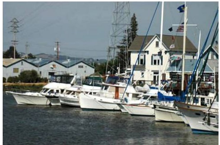
Turning Basin in front of the Petaluma Yacht Club