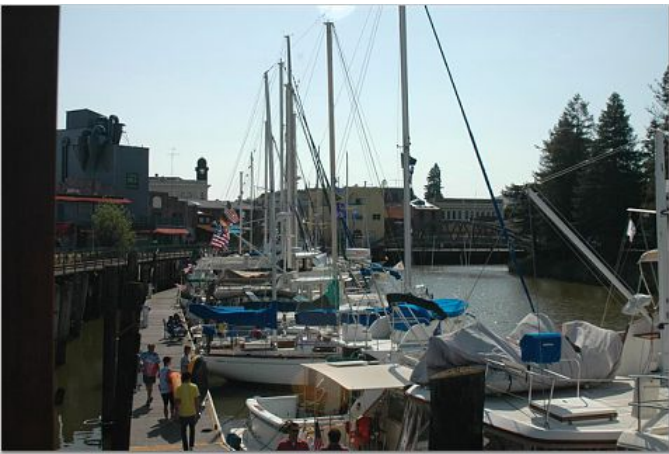
The Petaluma Turning Basin was hopping