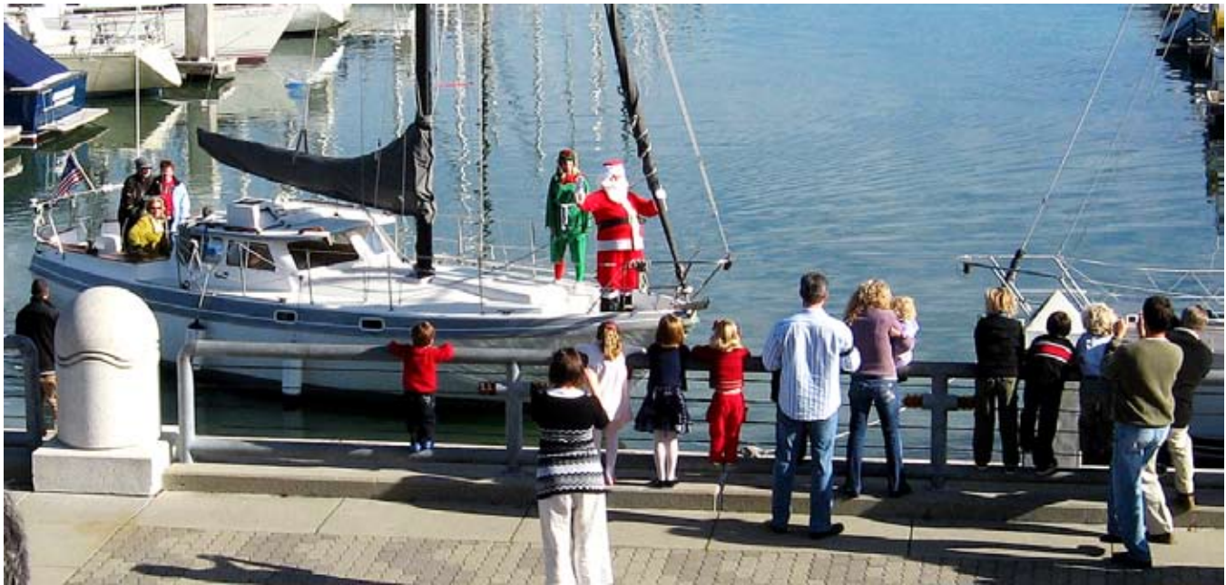
The kids and parents waited with great anticipation for Santa to land and come to the clubhouse