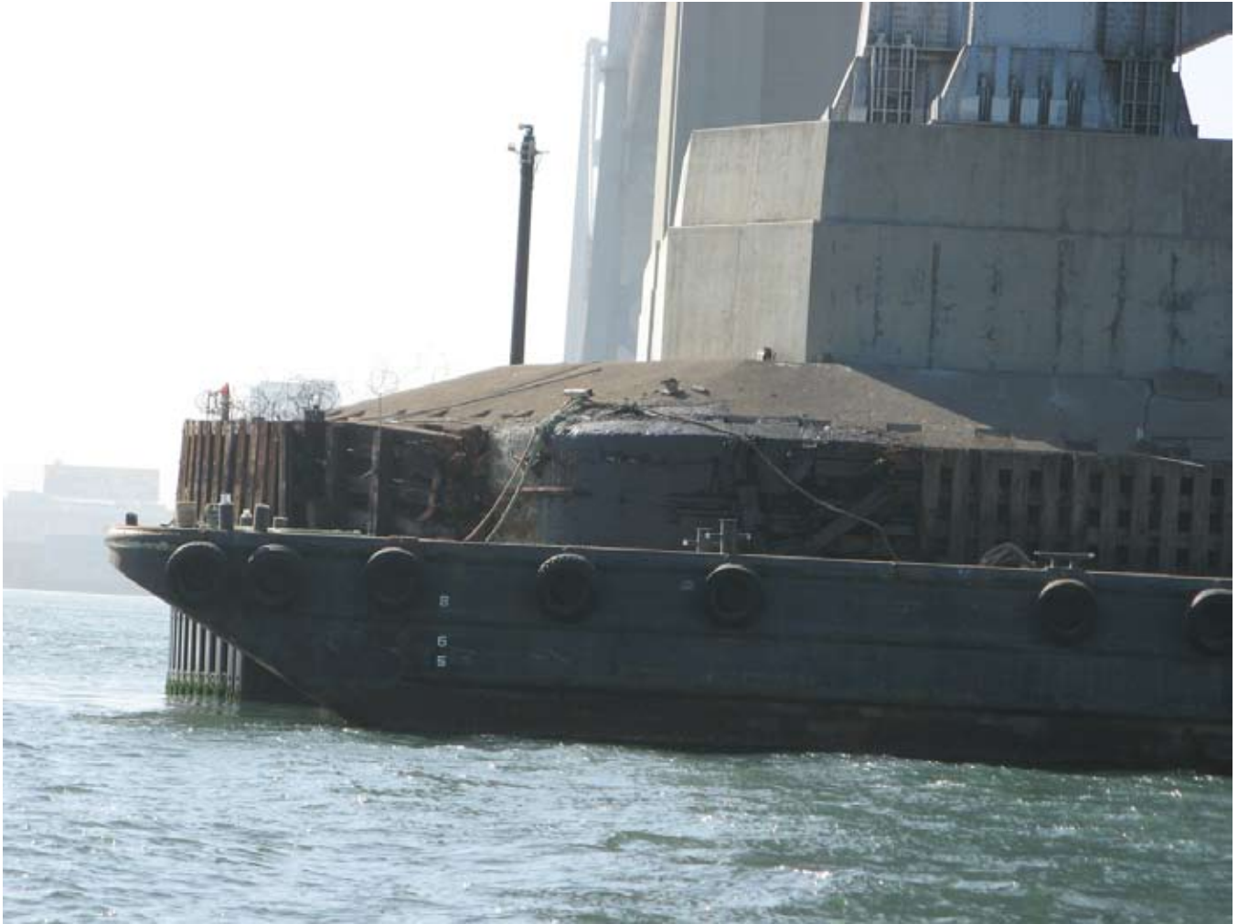
Oil still stained the Bay Bridge Pier where the Cosco Busan hit more than a week later

It was a sunny day the first weekend the bay was open to pleasure boating. My sister was in town with her family. We were going to take them on the usual tour of the bay, and ultimately had a great time, as one always does when you tour the beautiful waterfront from South Beach all the way to the Marina District. As we headed out of South Beach Harbor, we decided to look at the Bay Bridge Pier to see the damage, and was surprised to see the pier still covered in oil on the corner where it had ripped the Cosco Busan bunker crude fuel tanks apart as the ship bounced and scraped along the bridge pier. We snapped pictures, and then tacked back to the Cityfront.