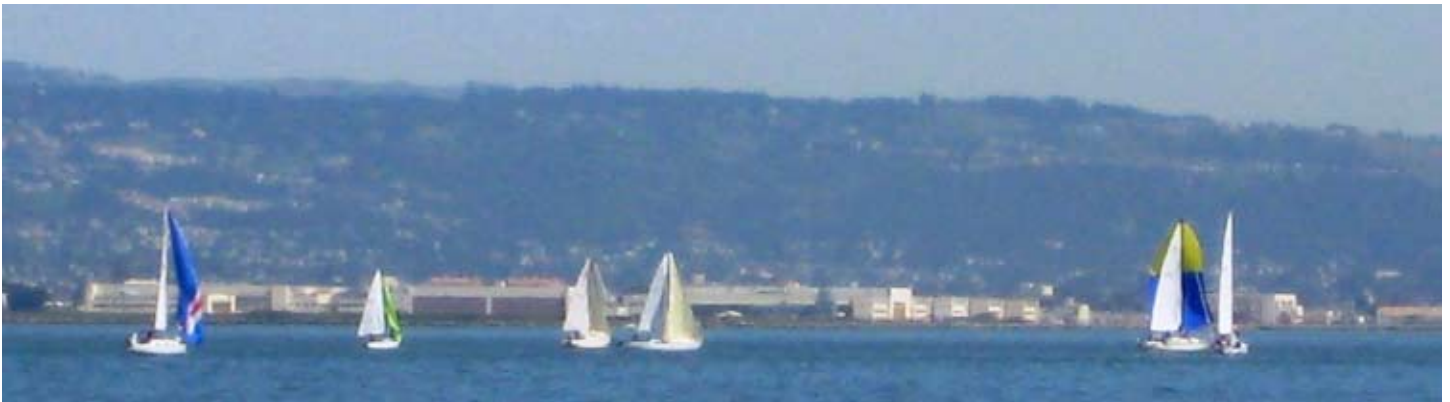
Division E struggles to make the first mark at "SC" during their race. The wind eventually arrived and everyone had a great race