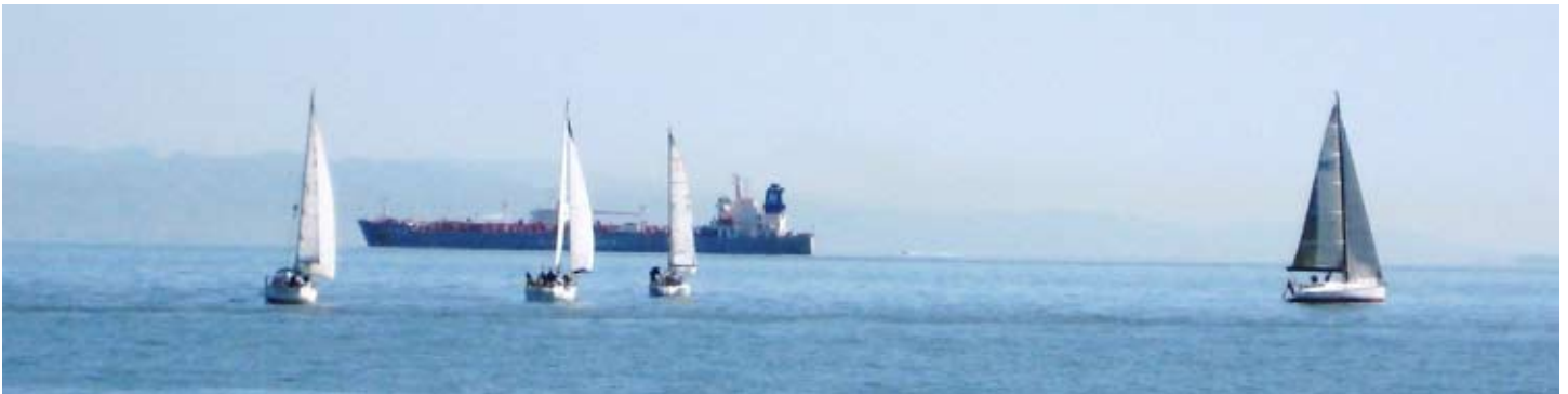
Division G - Nonspinnaker has a rip-snorting drift down to their first mark, No. 34"