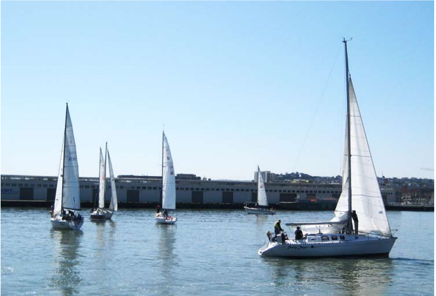
Reality Cheque makes a mainsail adjustment on her new mast while Division D waits for the wind during postponement